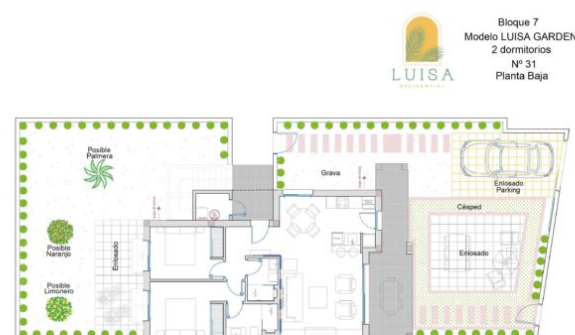
LUISA RESIDENTIAL - 31 LUISA GARDEN

Los exteriores incluyen enlosado, grava y césped según plano * Plantas y riego no incluidos The exteriors include paving, gravel and grass according to house plans * Plants and irrigation are not included