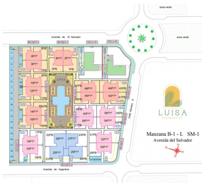
LUISA RESIDENTIAL - GENERAL PLAN

Property information may be subject to errors and is not contractual. The surfaces expressed are approximate, being able to undergo modifications for technical reasons. Artistic Images Free Of Contractual Nature.