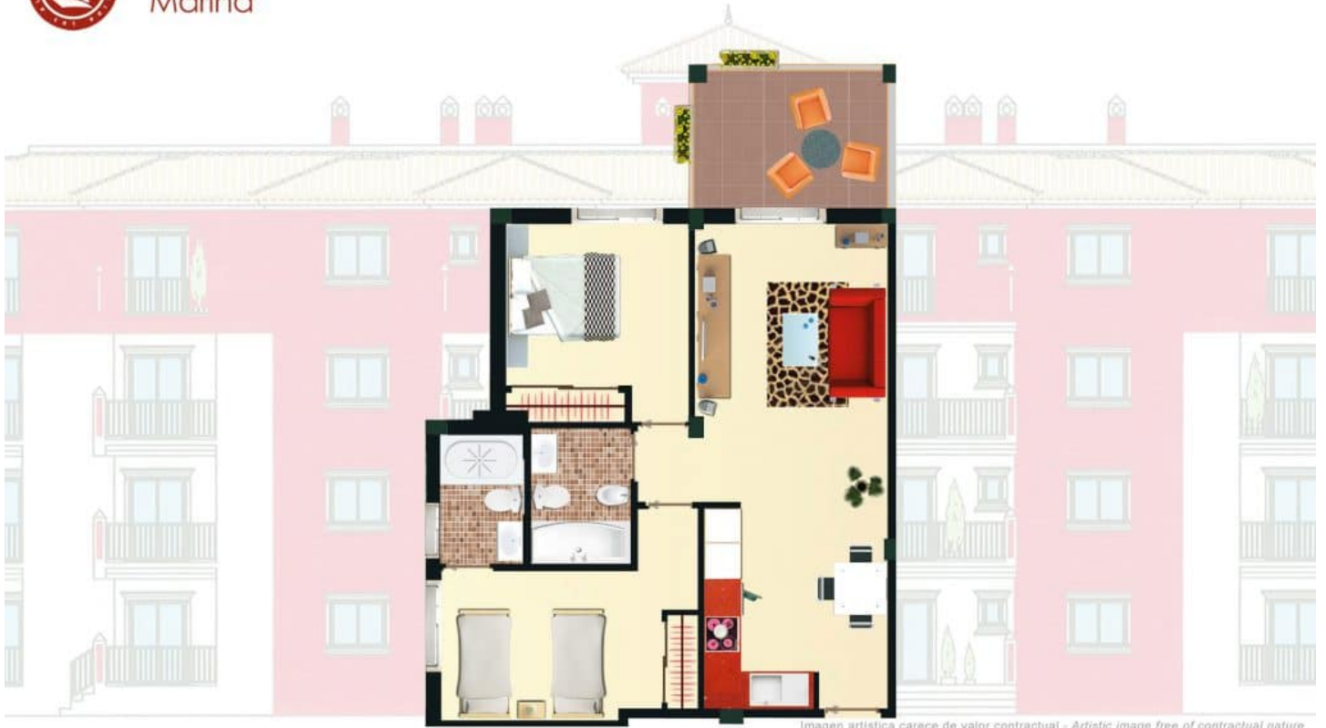
Imagen artística carece de valor contractual - Artistic image free of contractual nature