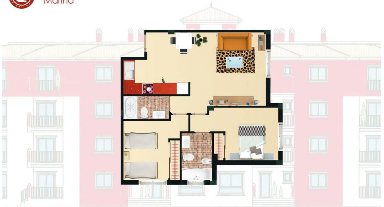
Imagen artística carece de valor contractual - Artistic image free of contractual nature